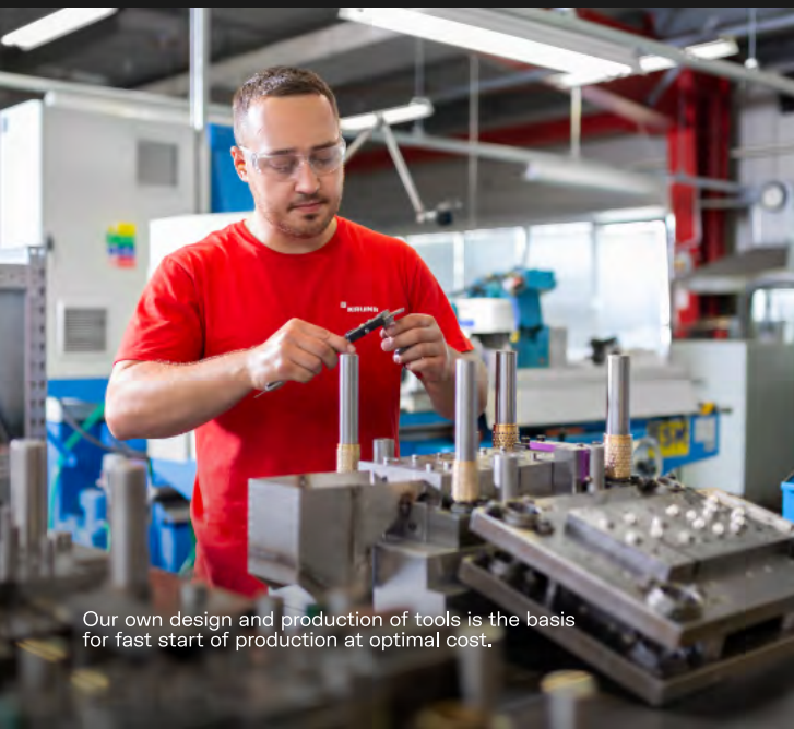
Our own design and production of tools is the basis for fast start of production at optimal cost.